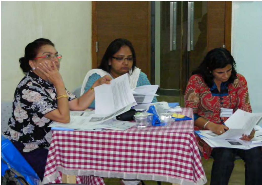
Download this photo – 266k