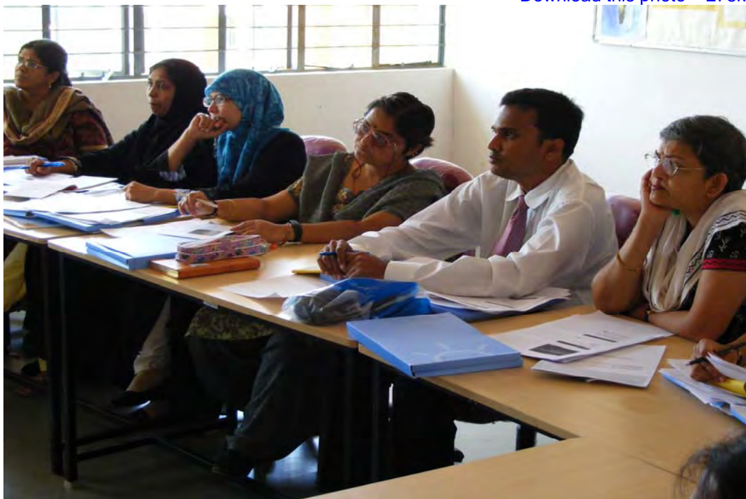
Download this photo – 264k