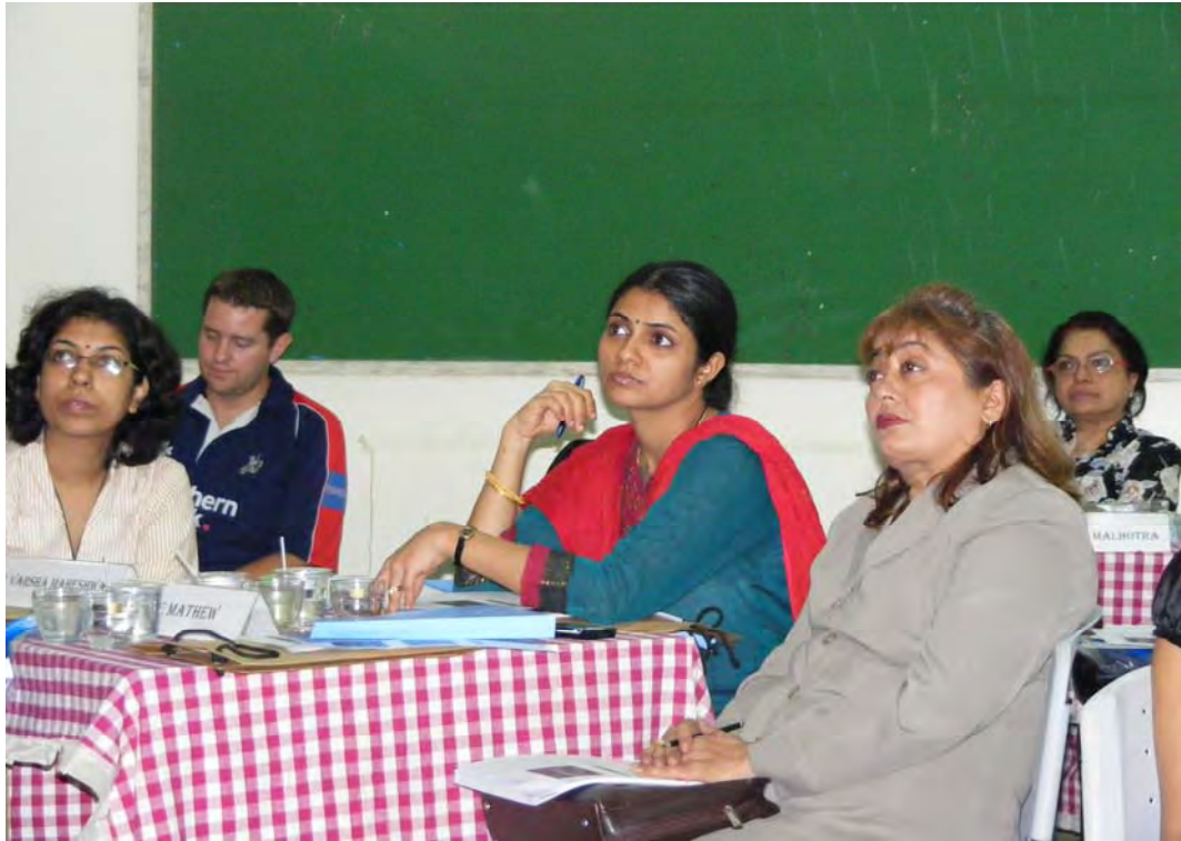
Download this photo – 286k