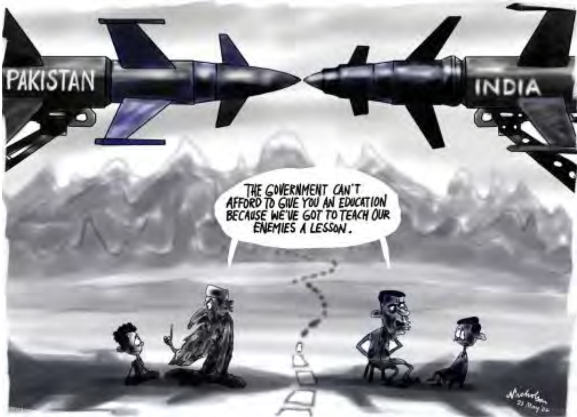
A cartoon from The Australian , published 2003 Download this image – 49k

The idea for building up a visual resources bank has been well received: here is the next input from Cambridge. For this issue, we have chosen three cartoons and a map on the subject of India as a nuclear power. These might be of value when considering with your class various aspects of Paper 1 Theme 4 ('India & the world').