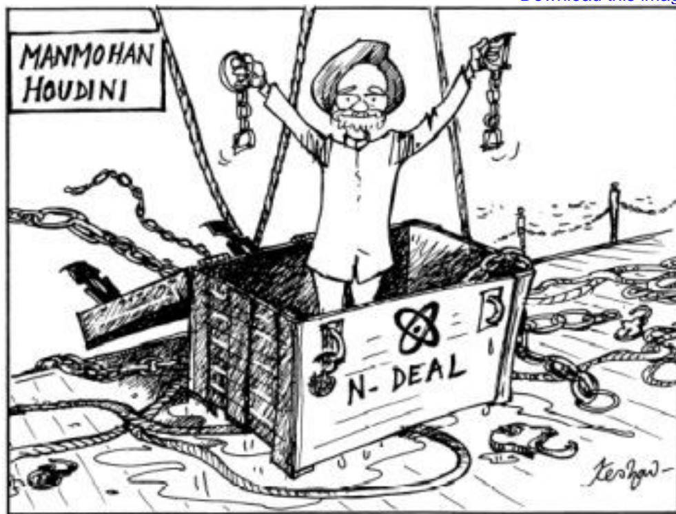
An Indian cartoon about the India-USA nuclear deal, The Hindu , 2007 Download this image – 46k