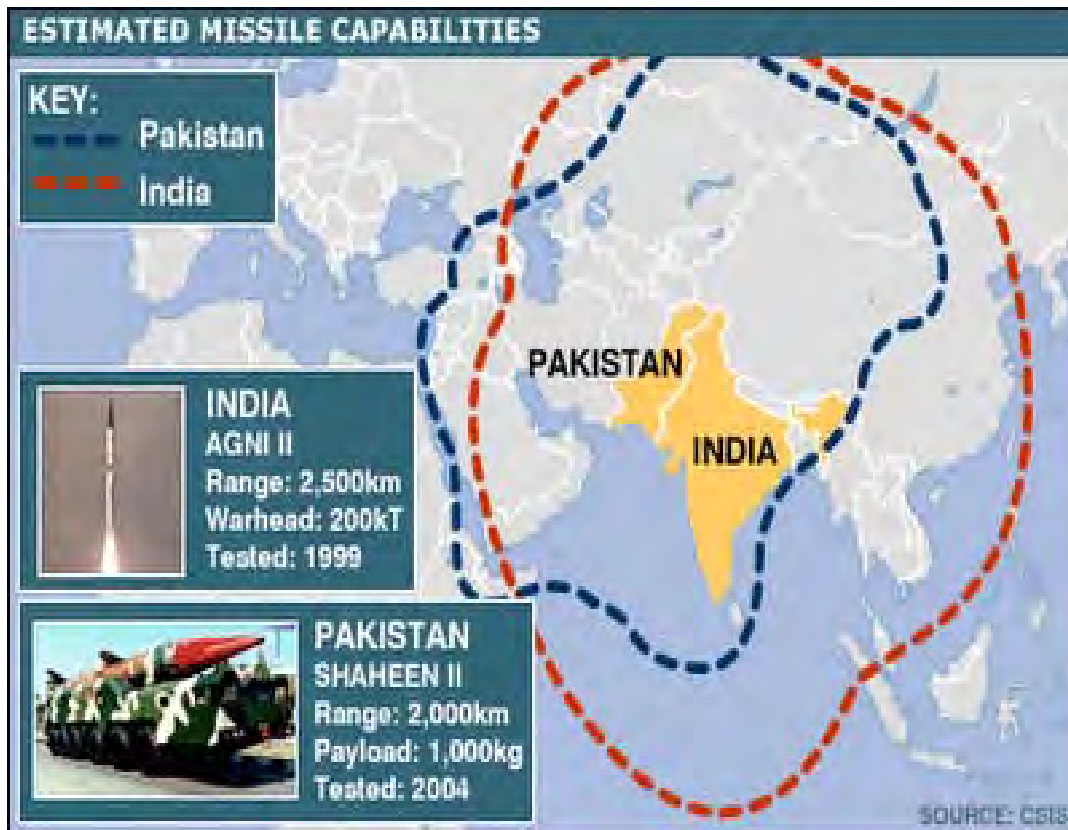
Map showing the estimated ranges of the ballistic missiles (nuclear or conventional) that could be launched by India and Pakistan, 2004 Download this map – 28k

If you have suggestions for specific visual items that we might circulate in future issues of India Matters and add to the teacher resource bank, please post them on the eDiscussion Forum, including details of what they are and where they came from.