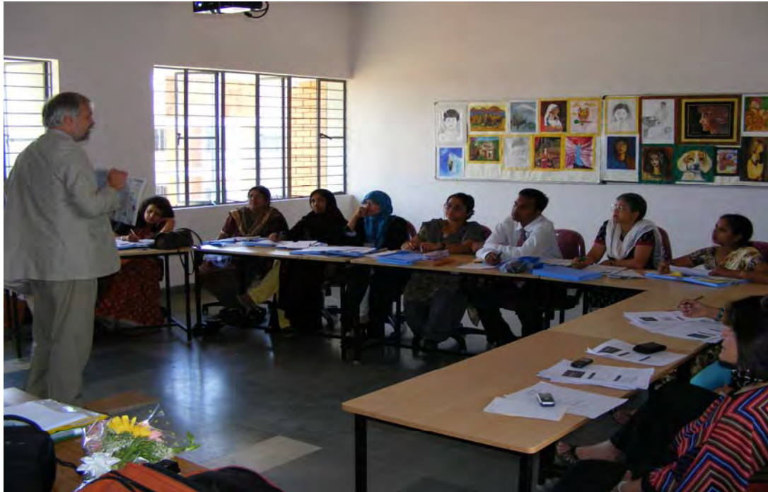
Download this photo – 278k